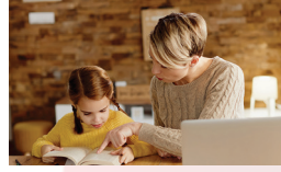
Home Schooling Panel