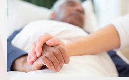
End of Life Panel